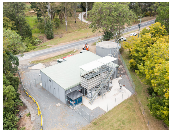
Canungra Water Treatment Plant.