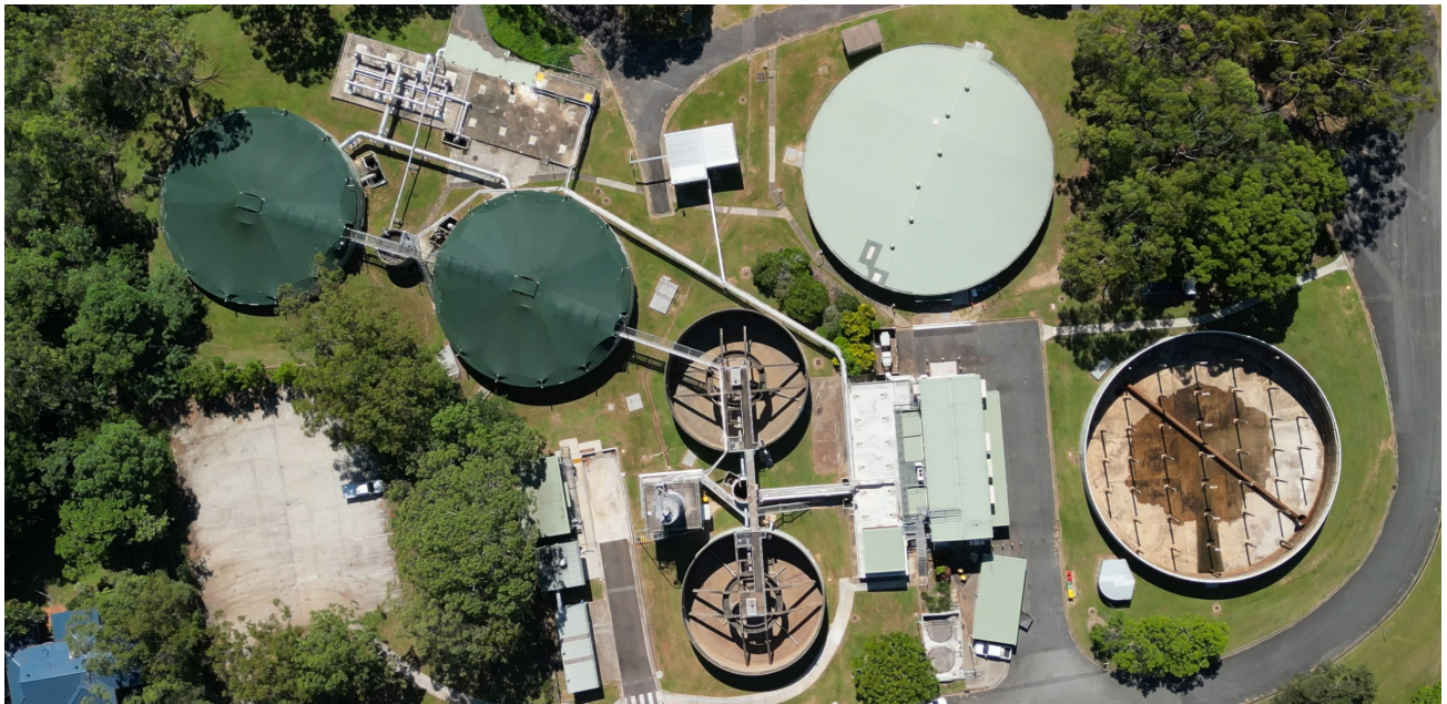
Capalaba Water Treatment Plant, next to Leslie Harrison Dam.

The Department of Regional Development, Manufacturing and Water (the department) is the NPR data coordinator for Queensland.