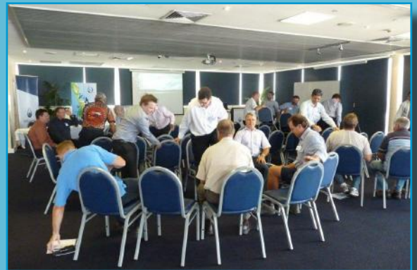
Some audience participation to discuss water literacy.