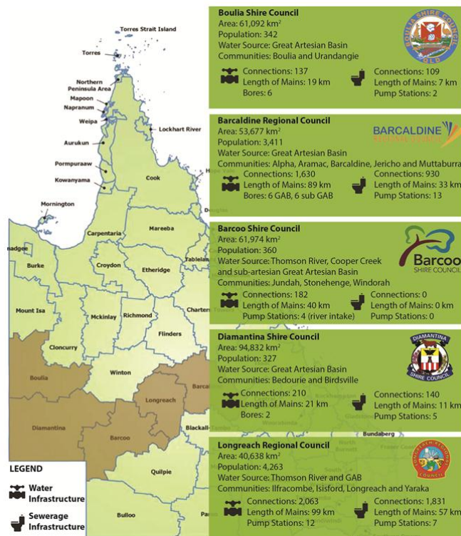
Figure 2 - The Outback Regional Water Alliance

The Alliance region has a total land area of 312,213 square kilometres, or 18% of the state total. This area is larger than the State of Victoria or the entire land area of New Zealand. Unsurprisingly given the large area, the region has some of the most remote communities in Queensland - with the average distance between communities being more than 50 kilometres. However, the region has only 16 urban communities that are home for less than 1% of Queensland’s regional population (4272 people as of the 2011 Census). The small population provides modest annual revenues for water and sewerage services of approximately $6 million. Many of the water supplies are supported by the Great Artesian Basin, a water source that requires little initial treatment but must be carefully managed and delivered to consumers to avoid contamination.