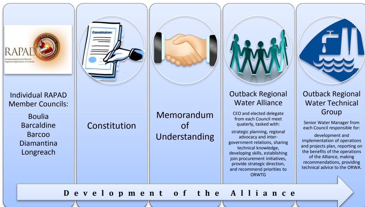
Figure 3 – The Alliance model for regional water collaboration in the RAPAD region

The RAPAD region completed its QWRAP investigations in late 2013. Acting on the recommendation to proceed with the Alliance model the group initiated formation activities between the participating councils, including establishment projects in early 2014. These included drafting a Constitution and MoU, determining governance and funding arrangements for the Alliance, and scoping a position for a part-time Alliance coordinator. Not only has the QWRAP initiative supported the region in making this decision, but it has also been a key support for encouraging the councils to proceed in the process to form the Alliance. In addition to formation activities, the Alliance has initiated a range of projects aimed at providing savings for the region.